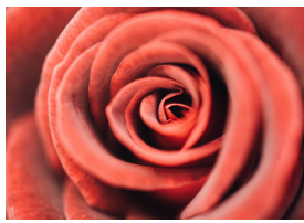
Beauty and the Beast

wall for guests to pose in front of. Use props like clocks, feather dusters, and tea cups to pose with. Set up a tripod or have someone designated to snap photos. You could even choose to set up a selfie station here.