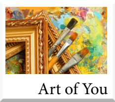
Art of You