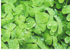
St. Patrick's Day