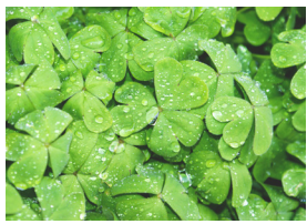
St. Patrick's Day

ger plates that will hold the napkin before dinner arrives.