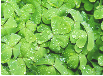
St. Patrick's Day