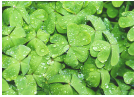
St. Patrick's Day