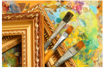
Art of You